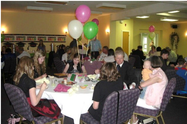
Graduation Banquet, Prince Albert, SK

It is such a great encouragement to minister in different areas and hear testimonies of what God has accomplished during previous visits. Sometimes results are evident immediately, while on other occasions it may take years to see the full harvest—and sometimes faithful sowing will only discover its full reward in eternity.