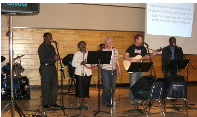
Worship Team, Grace Community Church, Regina,