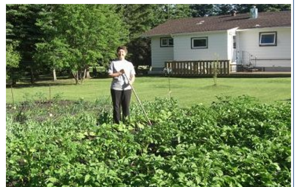
Working in my Garden