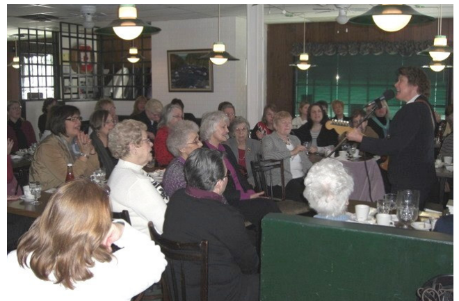
nearly 50 ladies packed in a restaurant for morning brunch